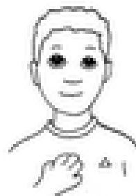
2. and of the Son,