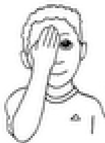
1. In the name of the Father,

In the name of the Father, and of the Son, and of the Holy Spirit. Amen.