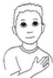
3. and of the Holy